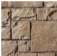
Range Amboise Beige