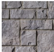
Range Newport Grey