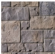
Range Chambord Grey