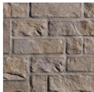
Range Lennox Grey