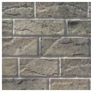
Range Lennox Grey*