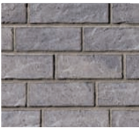
Range Newport Grey*