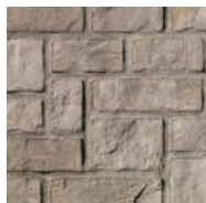
Range Margaux Beige