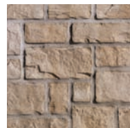
Range Amboise Beige