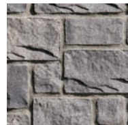
Range Newport Grey