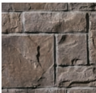
Range Lennox Grey