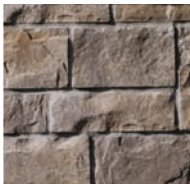
Range Margaux Beige